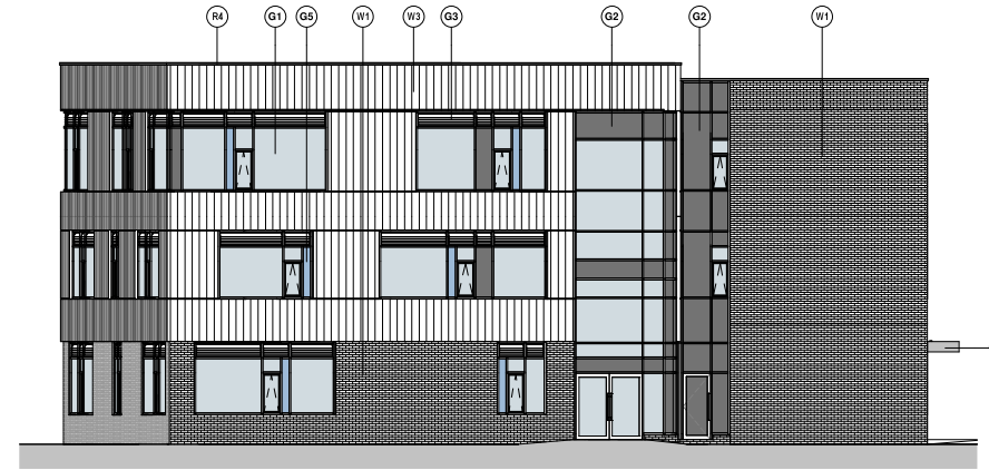
South East Elevation 1 : 100