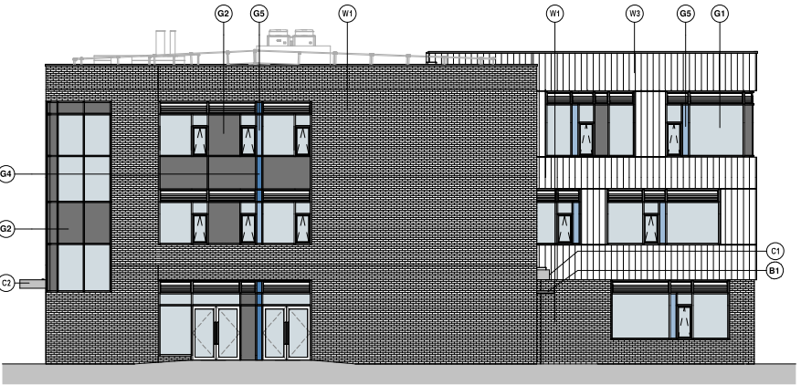
North West Elevation 1 : 100