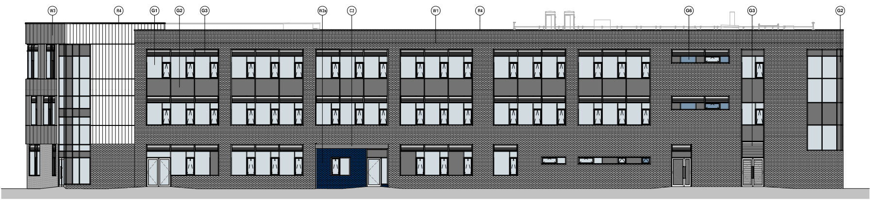
North East Elevation 1 : 100