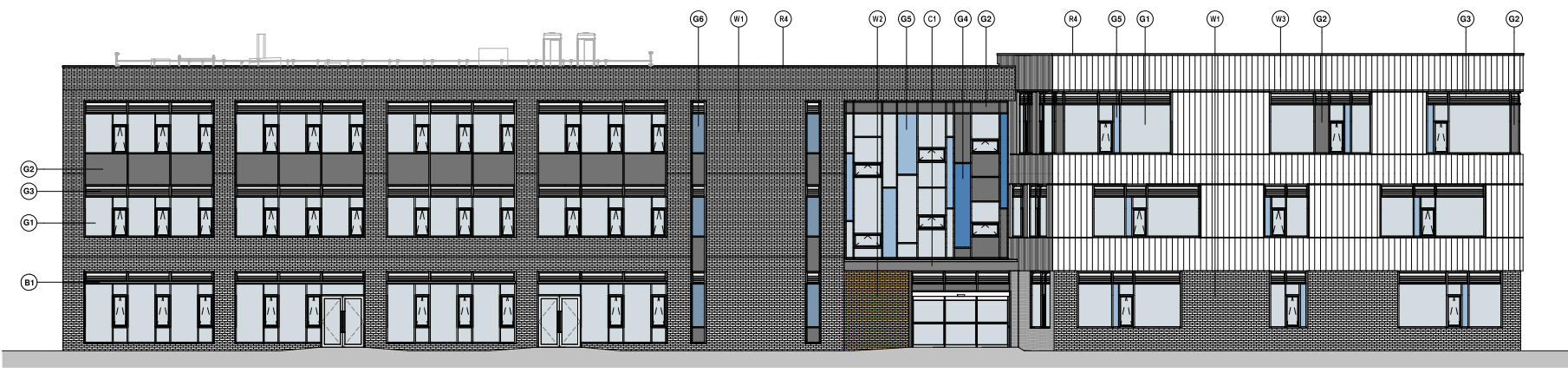
South West Elevation 1 : 100